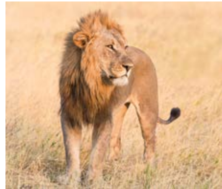
Opposite page: Hot air balloon safari Above clockwise from left: Pool at Four Seasons Safari Lodge Serengeti; Local Masai; Lion

Embark on a safari in the Serengeti, the vast African grasslands where the world's largest and most diverse concentration of game roams under a seemingly infinite sky.