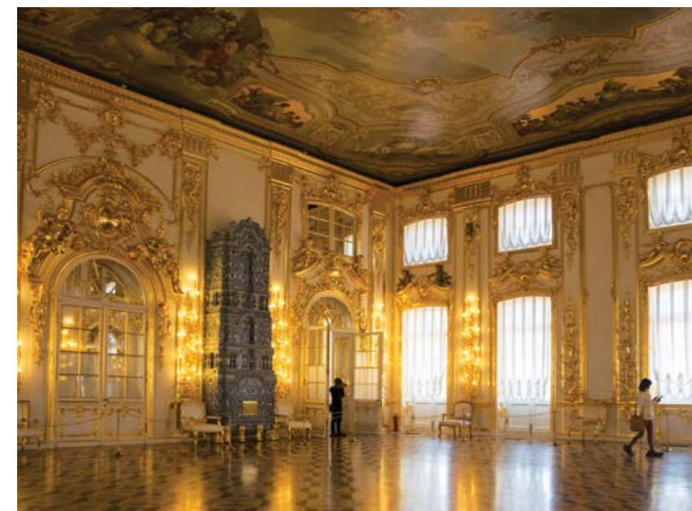
Opposite page: Church of Our Saviour on Spilled Blood Below clockwise from left: Catherine Palace; Ballerinas; Room at Four Seasons Hotel Lion Palace St. Petersburg

Housed in a 19th-century Russian royal residence, Four Seasons Hotel Lion Palace St. Petersburg is the city's premier five-star luxury hotel. Restored to its imperial glory, this architectural treasure in the historic Admiralteysky District offers easy access to the Hermitage Museum, Nevsky Prospekt and the Mariinsky Theatre. Enjoy a Russian-style tea in one of the palace's original courtyards and revitalize in a traditional Russian steam room at the luxurious Spa.