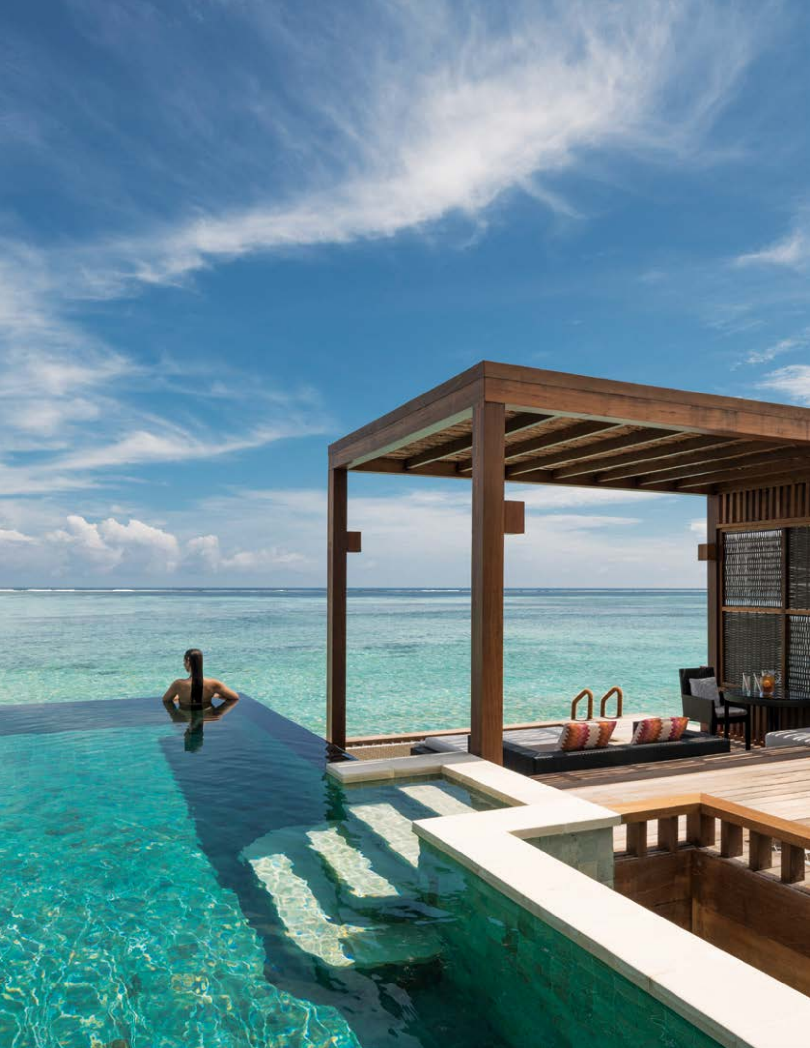
Opposite page: Private overwater villa. Below clockwise from top left: Award-winning treatments; Traditional Maldivian dhoni; Surf lesson

Four Seasons Resort Maldives at Kuda Huraa enchants with traditional thatched roofs and white-stone walls, plus an award-winning Spa on a picturesque tropical island surrounded by crystal waters. This recently refurbished property features two stunning pools—a free-form serenity pool on a secluded beach and a freshwater infinity pool surrounded by a large sundeck—as well as pools at each overwater villa.