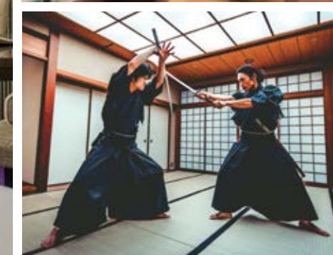
Opposite page: Arashiyama Bamboo Grove Above clockwise from left: Room at Four Seasons Hotel Kyoto; Traditional tea ceremony; Samurai sword lesson

The imperial legacy of Kyoto lives on in exquisite temples and gardens alongside innovative contemporary art and a flourishing culinary scene.