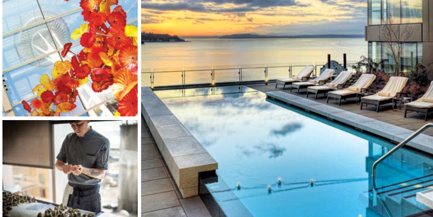
Opposite page: Four Seasons Hotel Seattle Above clockwise from top left: View of the Space Needle from Chihuly Garden and Glass; Pool at Four Seasons Hotel Seattle; Goldfinch Tavern

Seattle's blend of urban sophistication and natural beauty makes the Emerald City the perfect spot to begin your journey.