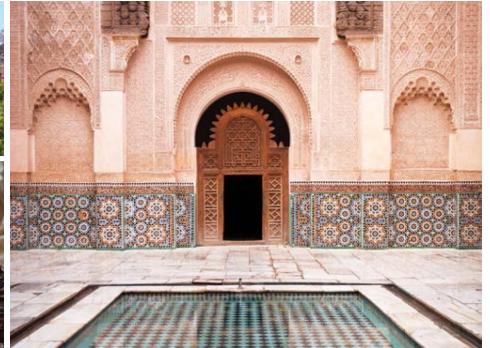
Opposite page: Pool at Four Seasons Resort Marrakech Above clockwise from top left: Atlas Mountains; Ornate Moroccan tilework; Preparing mint tea

With bustling markets and expansive views, the Red City of Marrakech is Morocco's exotic imperial capital and the gateway to the Atlas Mountains.