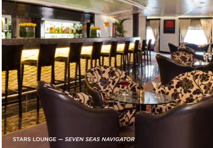
STARS LOUNGE — SEVEN SEAS NAVIGATOR