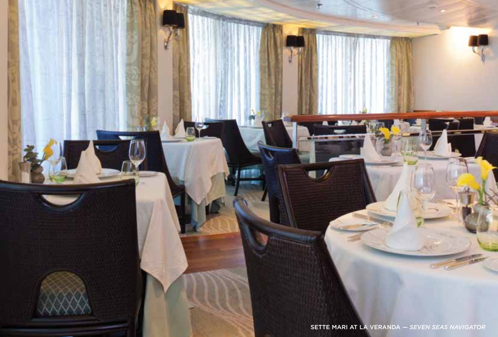
SETTE MARI AT LA VERANDA — SEVEN SEAS NAVIGATOR