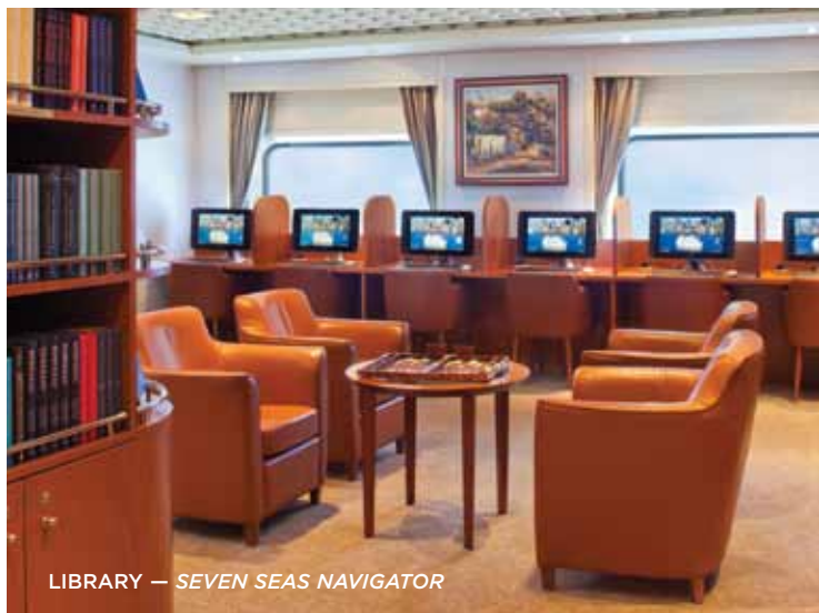
LIBRARY — SEVEN SEAS NAVIGATOR