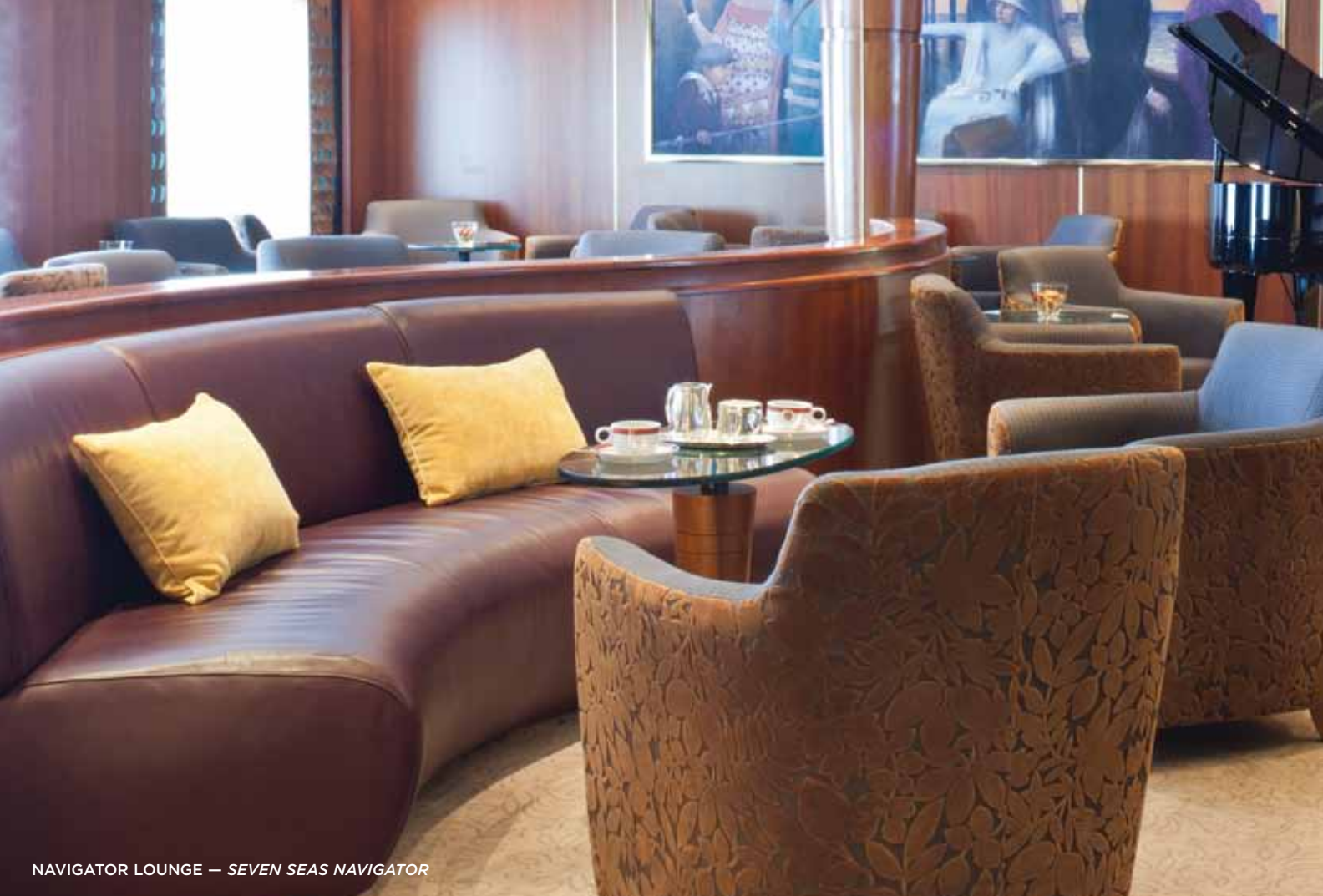
NAVIGATOR LOUNGE — SEVEN SEAS NAVIGATOR