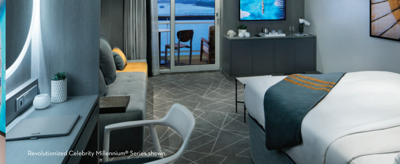
Revolutionized Celebrity Millennium® Series shown.