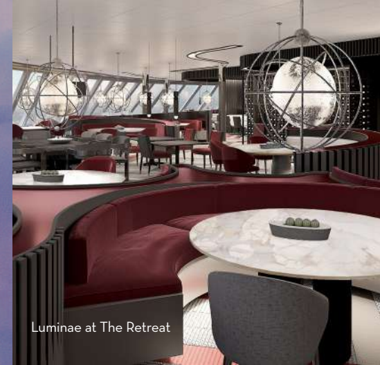
Luminae at The Retreat