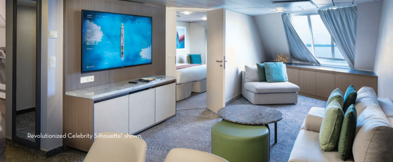
Revolutionized Celebrity Silhouette® shown.