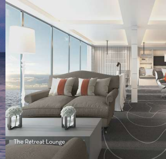
The Retreat Lounge