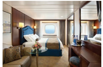
Deluxe Ocean View Stateroom

Elegant decor graces these handsomely appointed 20-square-metre staterooms that boast our most requested luxury – a private teak veranda.