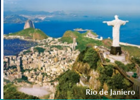
Rio de Janeiro

plus: US$100 SHIPBOARD CREDIT* per stateroom on select sailings