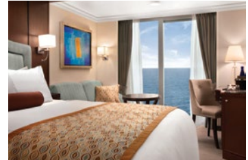
Deluxe Ocean View Stateroom