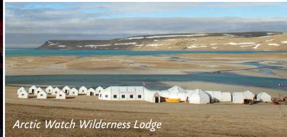
Arctic Watch Wilderness Lodge