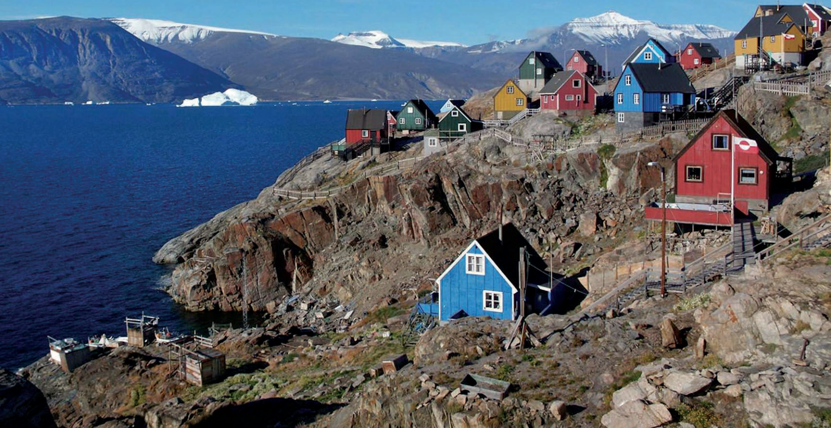
Colorful communities dot the Greenland coastline