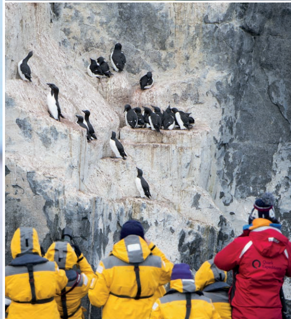
The majestic Arctic icon; kayakers have a bear's-eye view; cliff-side bird watching