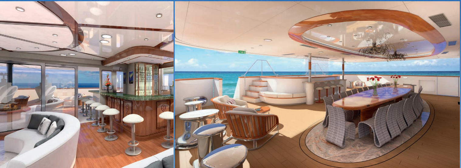
These artist renderings are just a sampling of the exclusive elegance that awaits you on board the opulent and intimate Legend