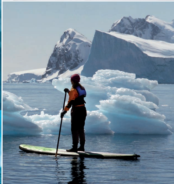
Antarctic ice formations present a million different shades of blue; a chinstrap penguin moves in for a close-up; paddleboarding through an iceberg graveyard