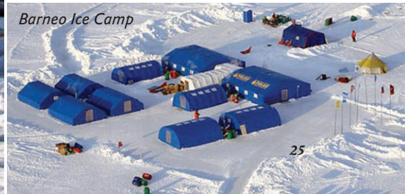
Barneo Ice Camp