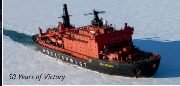
50 Years of Victory