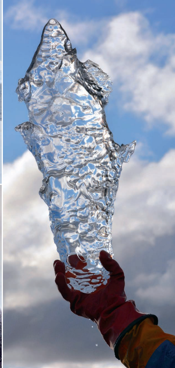
Seals strike a pose; a cold handshake; Gentoo penguin chicks