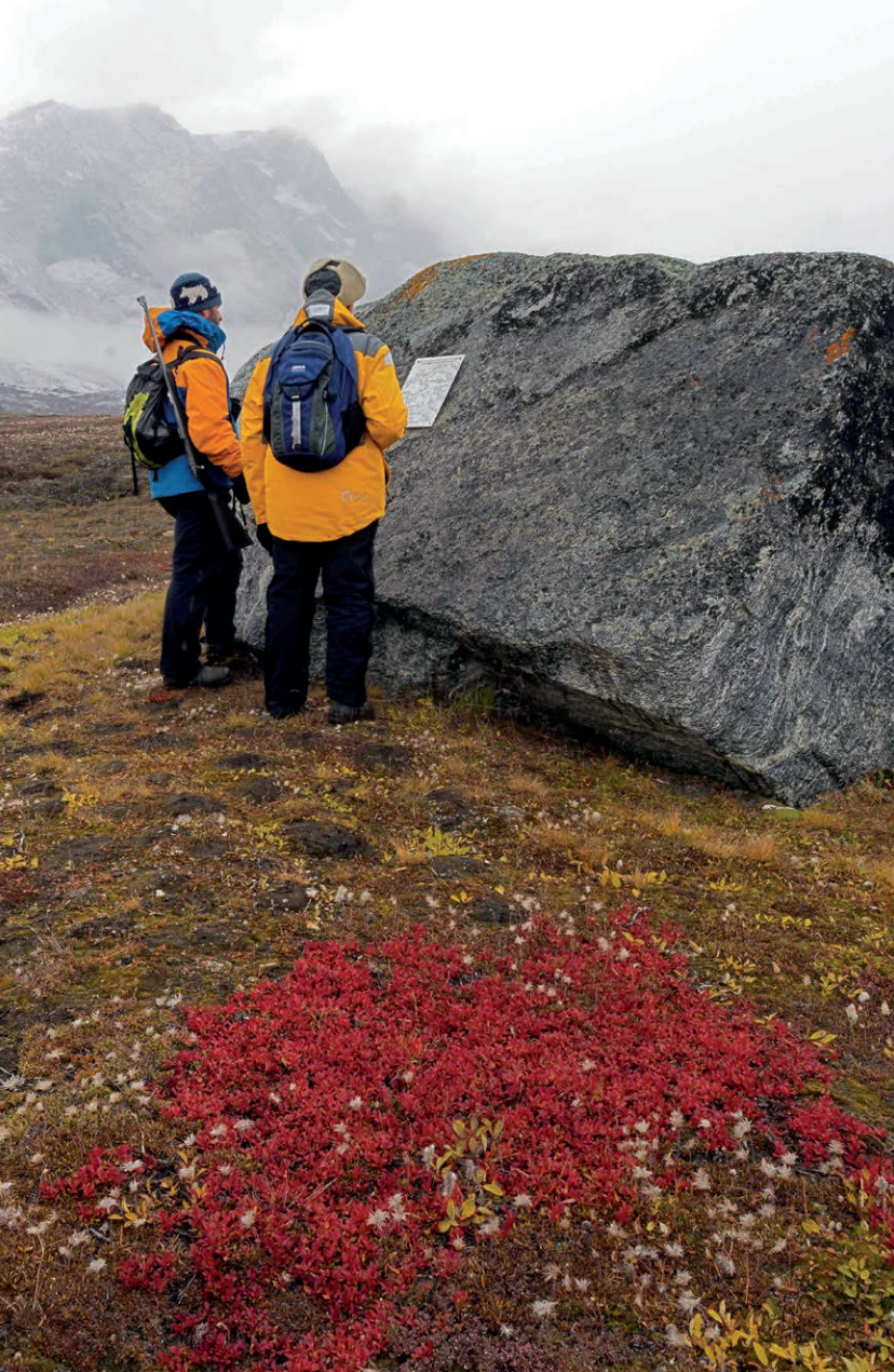
Connecting with experts and nature