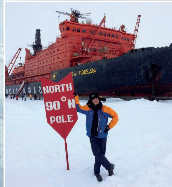
Enjoying a beautiful balloon ride at 90°N; a furry polar pal; an explorer revels in reaching the top of the world