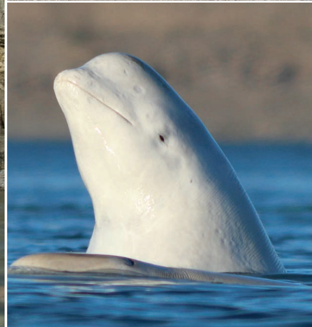
Natural spectacles are in abundance near the lodge; four-wheeling it; great white whales